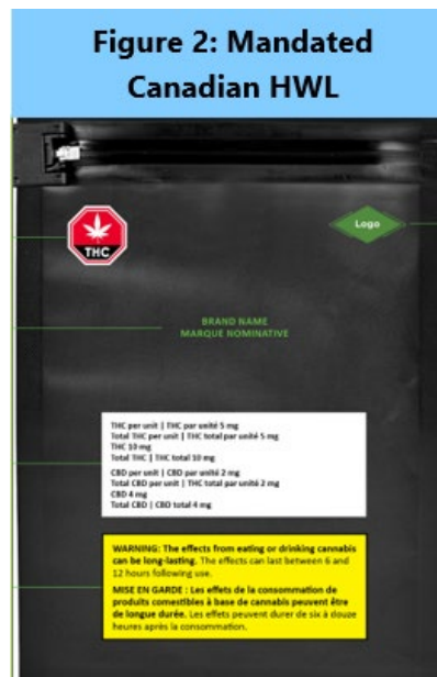
NOTE: Figure 2 depicts a Canadian cannabis product that has a large HWL with a yellow background and black print.

In New Jersey, for any cannabis item that contains a total THC percentage >40 percent the following warning must be printed in no less than 10pt font on the front of the package and may not wrap around the side of the package: “This is a high potency product and may increase your risk for psychosis.”