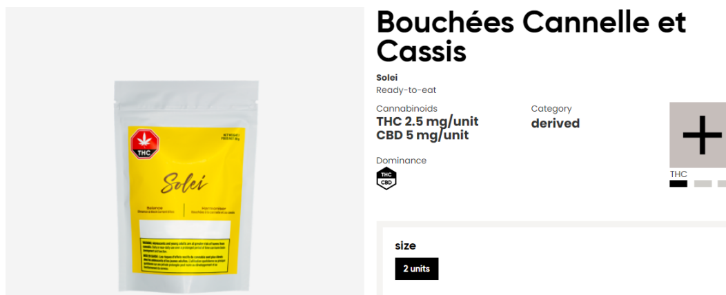
Figure 4: Serving definition and number of total THC servings in cannabis product in Canada

NOTE: Figure 4 demonstrates a Canadian cannabis product labeled with a serving definition (2.5mg THC & 5mg CBD) and the total numbers of servings in the product (2).