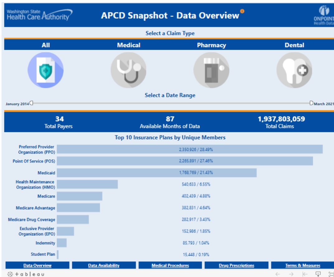
Figure 3 WA-APCD Snapshot – Data Overview Refer to the “Terms and Measures” tab on https://www.wahealthcarecompare.com/wa-apcd-snapshot for definitions

The LO contracted with Onpoint Health Data (Onpoint), the data vendor, in compliance with the requirements of RCW 43.371.020(3) to ensure successful database operations.