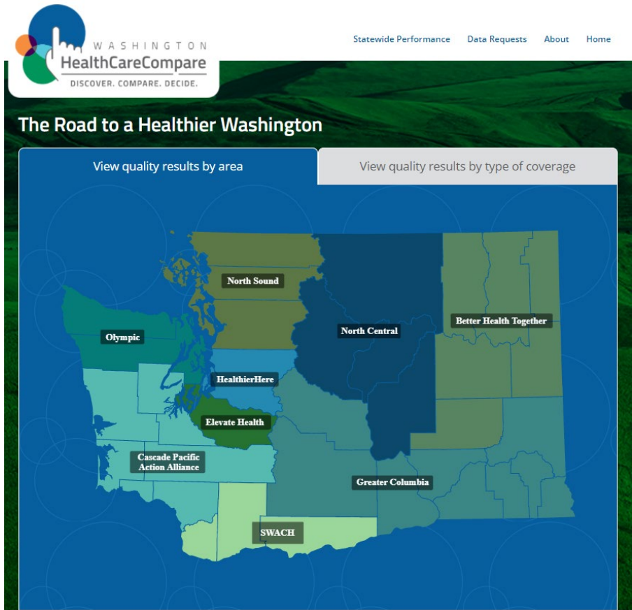
Figure 2 Compare the cost and quality across Accountable Communities for Health

The LO contracted with Forum One, the web vendor in compliance with the requirements of RCW 43.371.020(3) to ensure successful website operations during this reporting period.