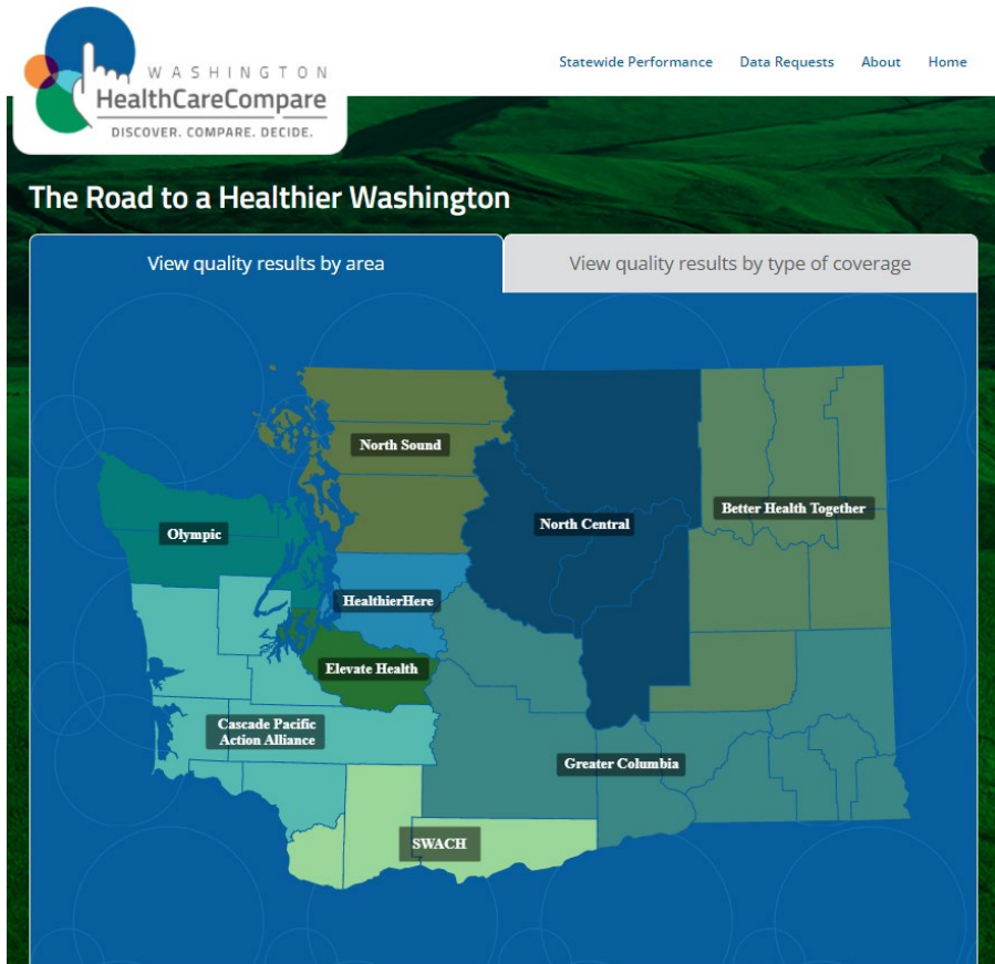
Figure 2 Compare the cost and quality across Accountable Communities for Health

The LO contracted with Forum One, the web vendor in compliance with the requirements of RCW 43.371.020(3) to ensure successful website operations during this reporting period.