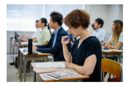
Culturally Responsive Training:

Principles and outline complete. Request for information in process Request for proposals summer 2023. Piloting fall/winter 2024